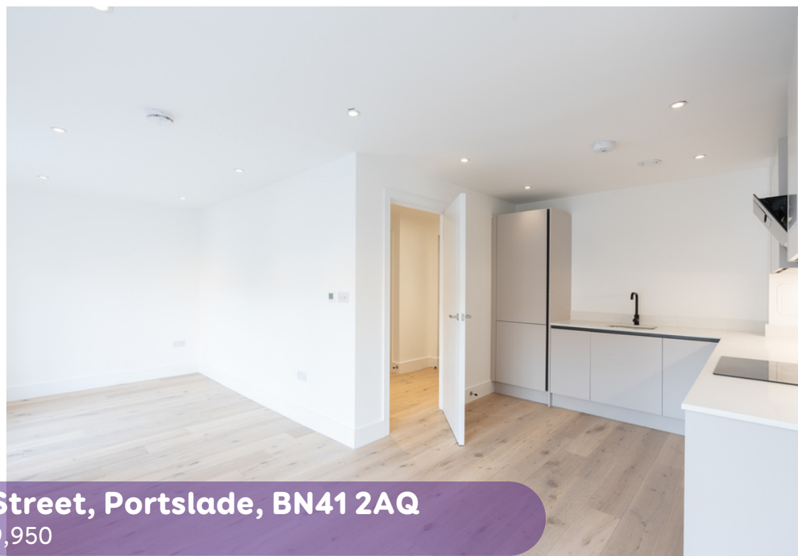
The Brewery 1881, 30 South Street, Portslade, BN41 2AQ £349,950