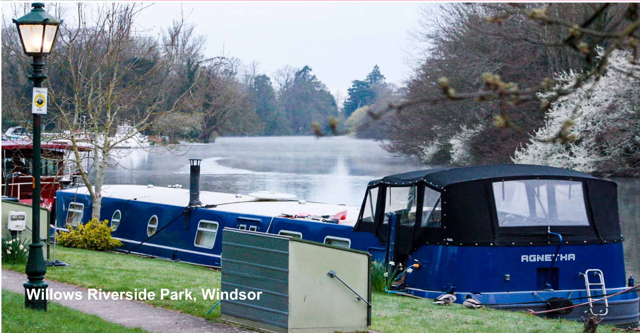
Willows Riverside Park, Windsor