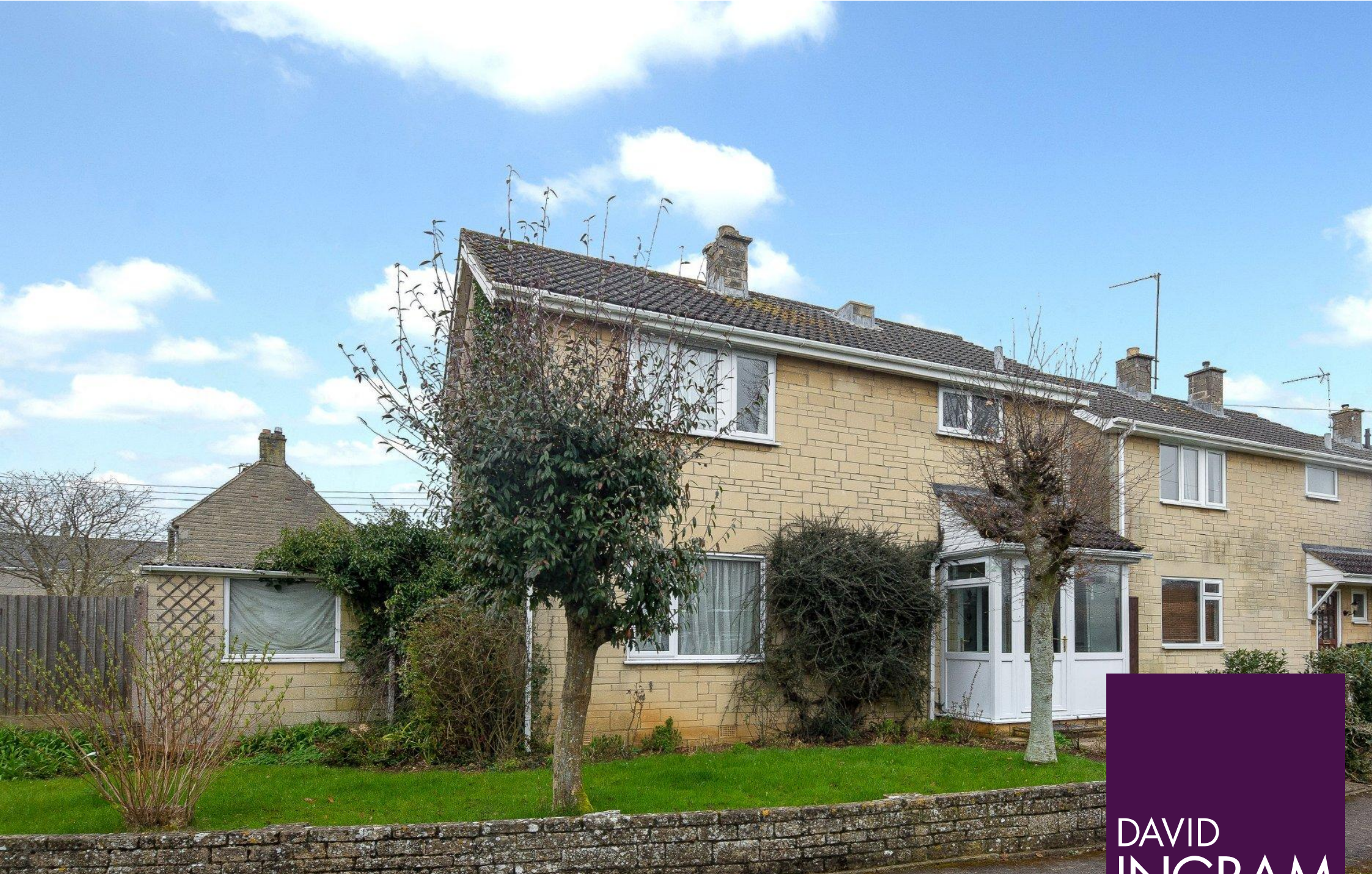
14 Little Challows, Biddestone, Chippenham, SN14 7DU