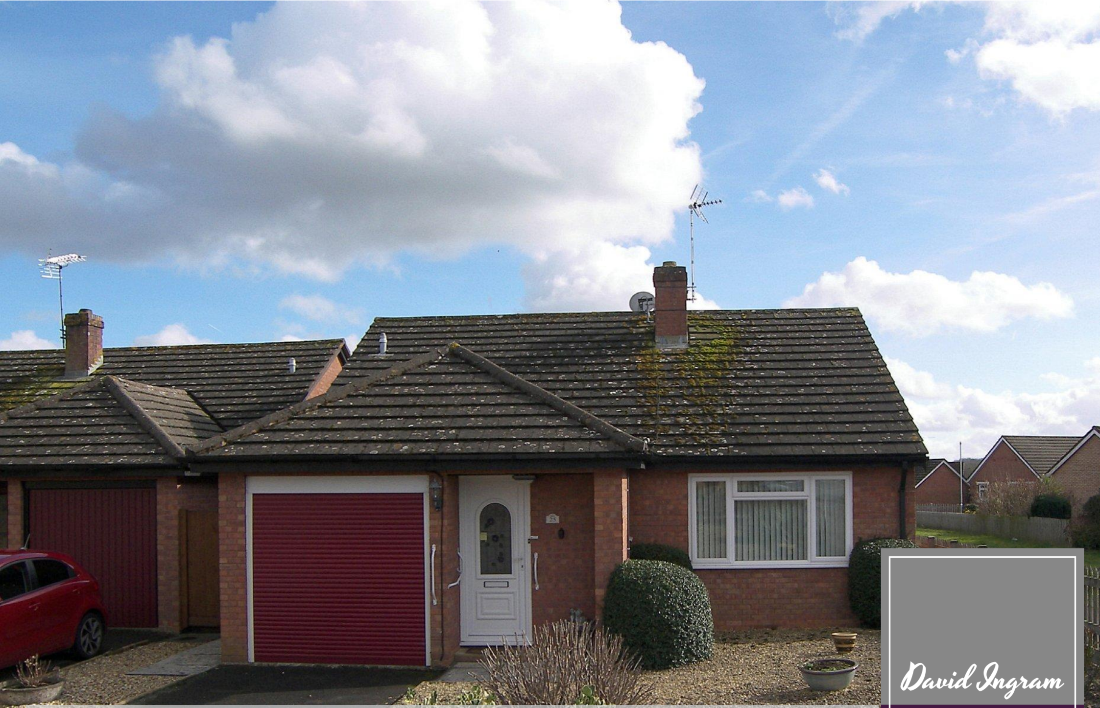
25 Bellott Drive, Corsham, Wiltshire, SN13 9UQ