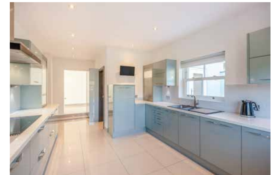
A Stunning Contemporary Space