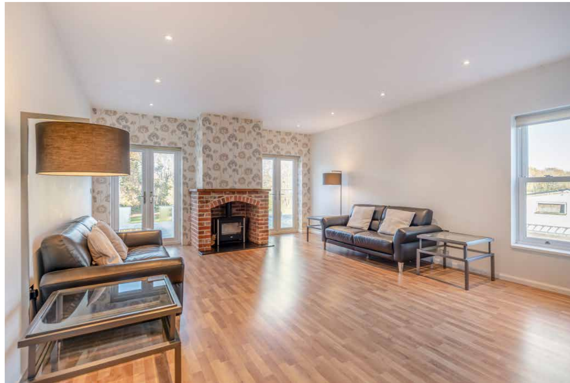
“With wonderful views out over the garden and surrounding countryside, it has a wood burner as its focal point...”