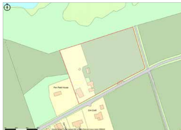
Promap Ordnance Survey Crown Copyright 2023. All rights reserved. Licence number 10002432 Plotted Scale - 1:1750, Paper Size - A4