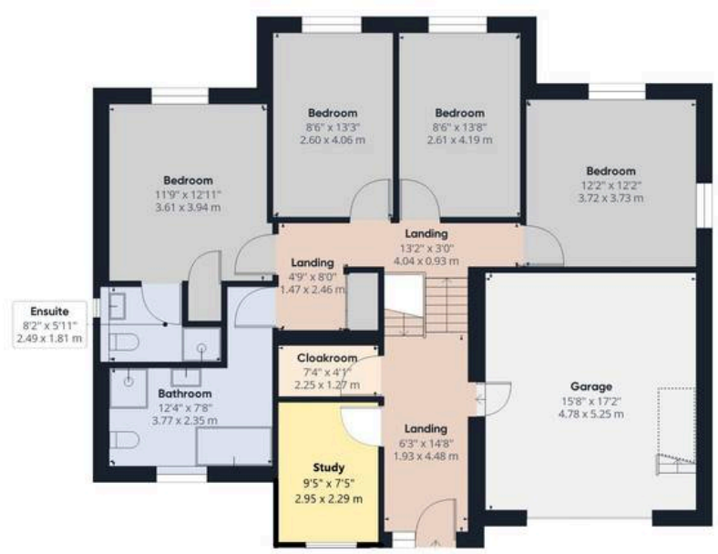
Landing & First Floor