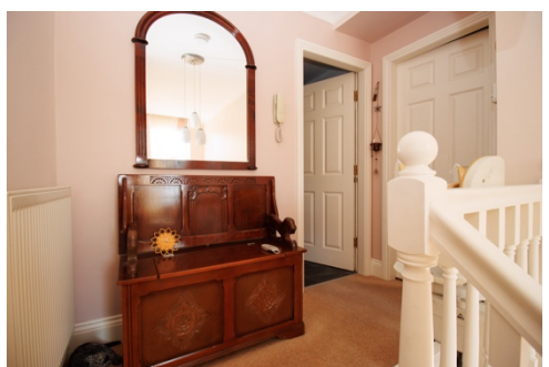
3.68m widening to 4.16m x 8.71m (12'1" widening to 13'8" x 28'7")

Two radiators, one with decorative cover. Two upvc double glazed sash tilt and turn windows to the front and two upvc double glazed sash tilt and turn windows to the rear.