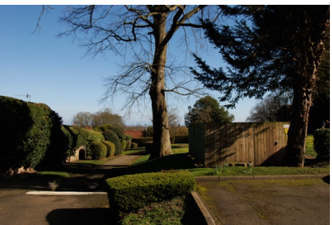
/ continued over