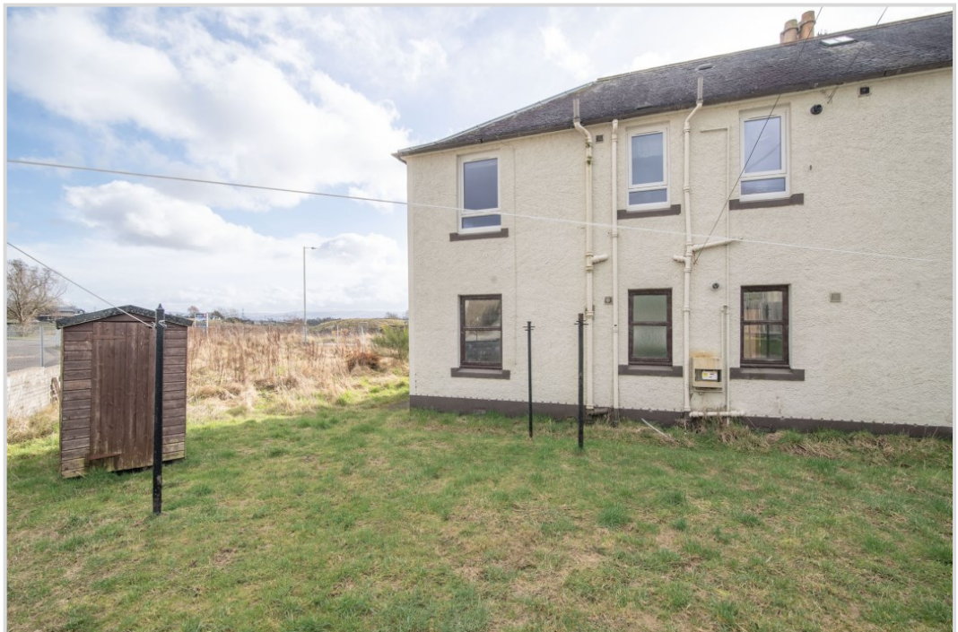
These particulars are believed to be correct, but their accuracy is not guaranteed and they do not form part of any contract. All measurements are approximate only.