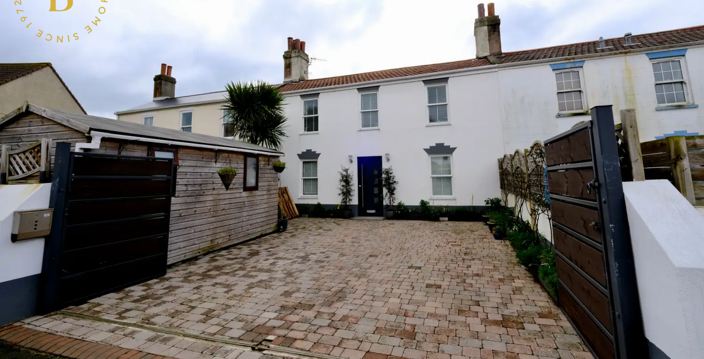
Lanerna, 9 Rosemount Cottages, James Road £675,000

BROADLANDS FINDING YOU A HOME SINCE 1972