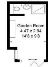
(Not Shown In Actual Location / Orientation) Outbuilding