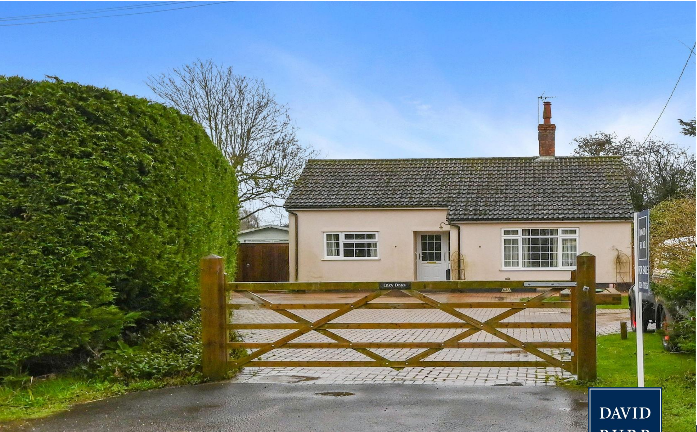
Lazy Days, Stanningfield, Bury St. Edmunds, Suffolk.