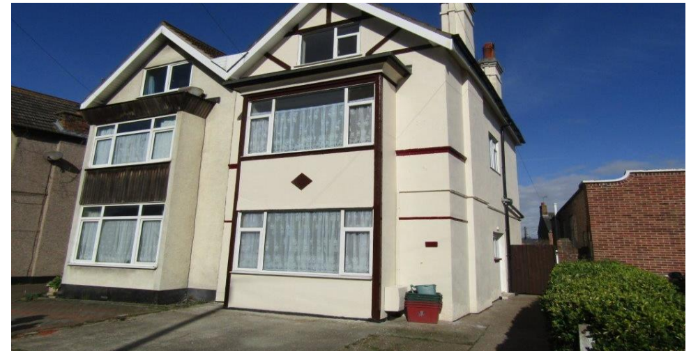
High Street Walton On The Naze, Essex

Rent: £2,000 pcm Energy Efficiency Rating E