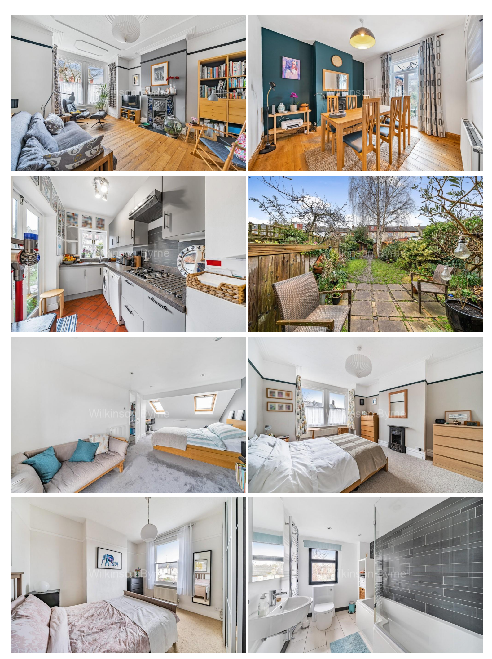
These particulars, whilst believed to be accurate set out as a general outline only for guidance and do not constitute any part of an offer or contract. Intending purchasers should not rely on them as fittings. Room sizes should not be relied upon for carpets and furnishings. The measurements given are approximate. No person in this firm's employment has the authority to make or give any representation or warranty in respect of the property.