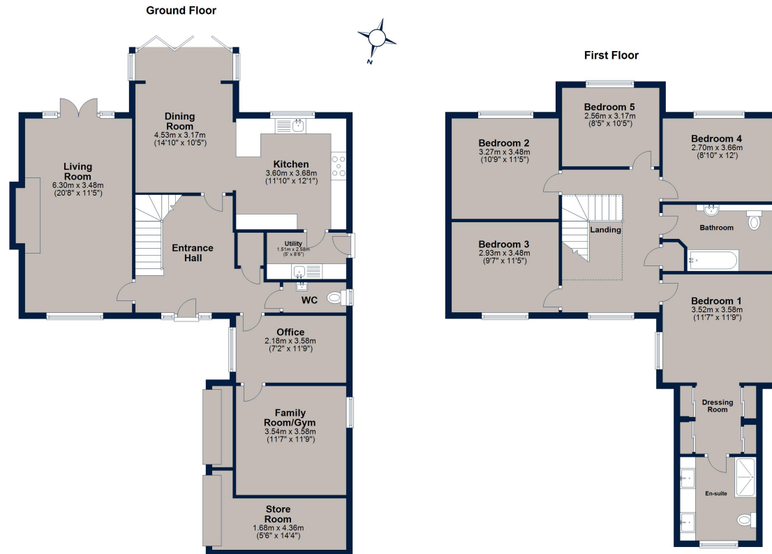
Total area: approx. 194.4 sq. metres (2092.0 sq. feet) Plan is for illustration purposes only and may not be representative of the property. Plan is not to scale. Plan produced by M-Photo Plan produced using PlanUp.