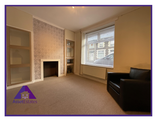
Glandwr Street, Abertillery, NP13 1TZ