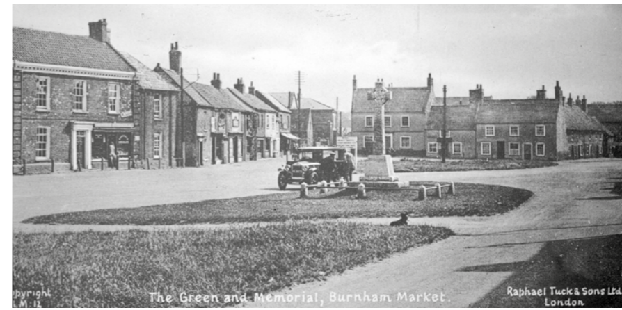
A historic photograph of Burnham Market.