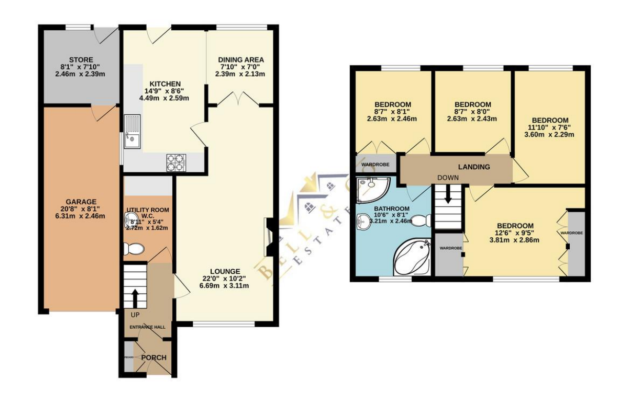
1ST FLOOR 500 sq.ft. (46.4 sq.m.) approx.

TOTAL FLOOR AREA : 1215 sq.ft. (112.9 sq.m.) approx. Whilst every attempt has been made to ensure the accuracy of the flooridan contained here measurements.