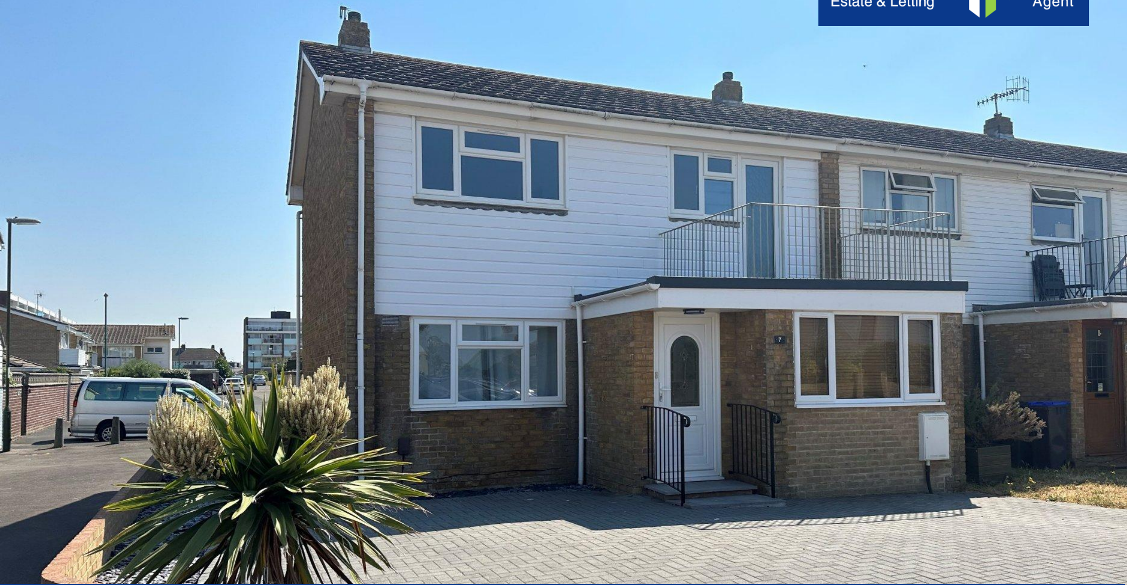
7 Weald Dyke, Shoreham Beach, West Sussex, BN43 5LP