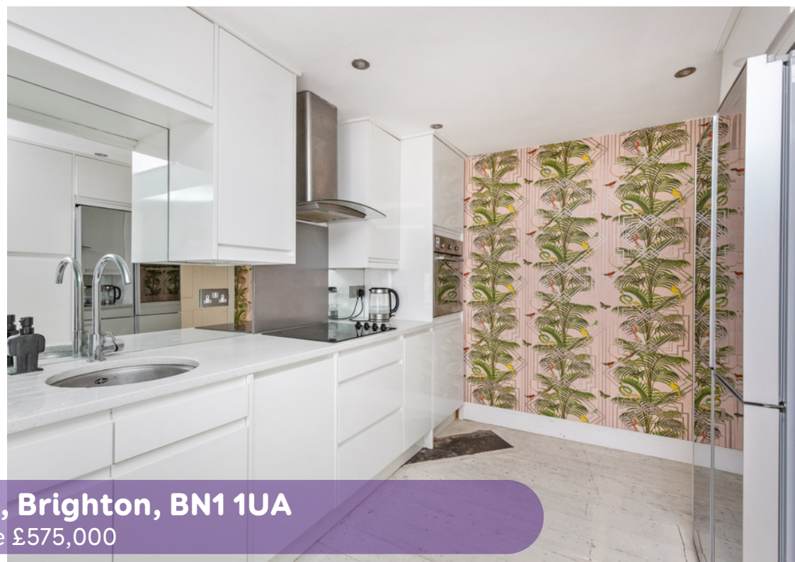
Marlborough Place, Brighton, BN1 1UA Asking Price £575,000