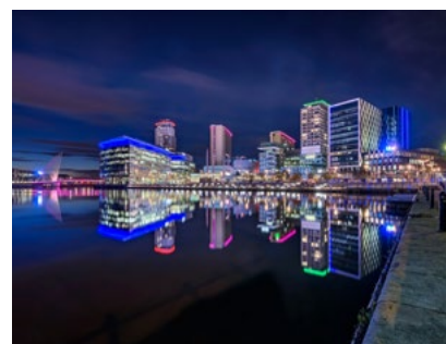
6 Salford Quays (200m)