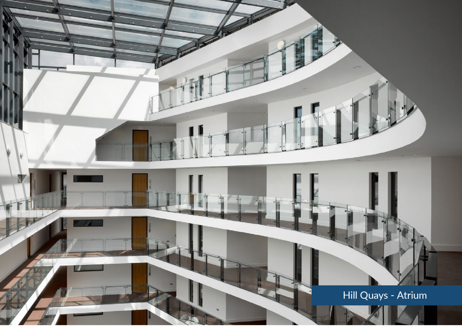
Hill Quays - Atrium