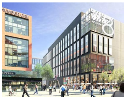
2 First Street Manchester (300m)