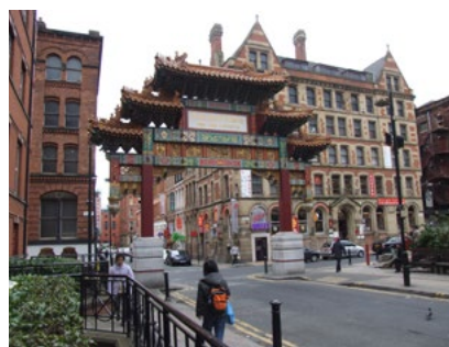
4 China Town (800m)