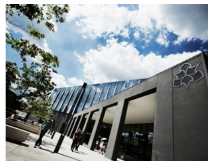
3 Manchester Metropolitan University (600m)