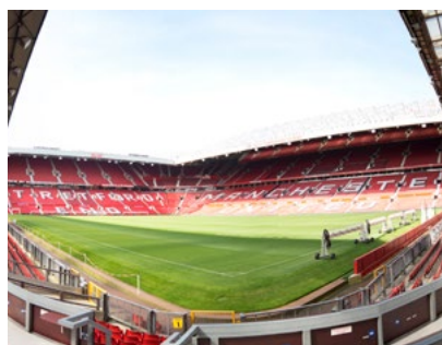
5 Old Trafford Stadium (2900m)