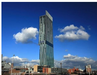
1 Beetham Tower & Expo Center (200m)

Manchester International Airport: 20 mins drive