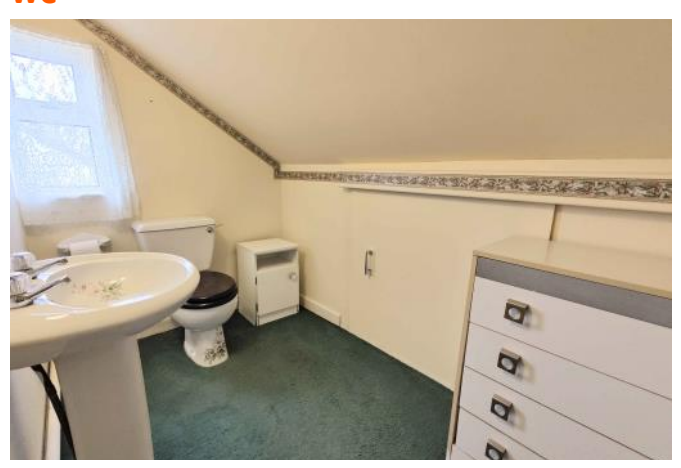
An ideal addition to the upper floor offering extra