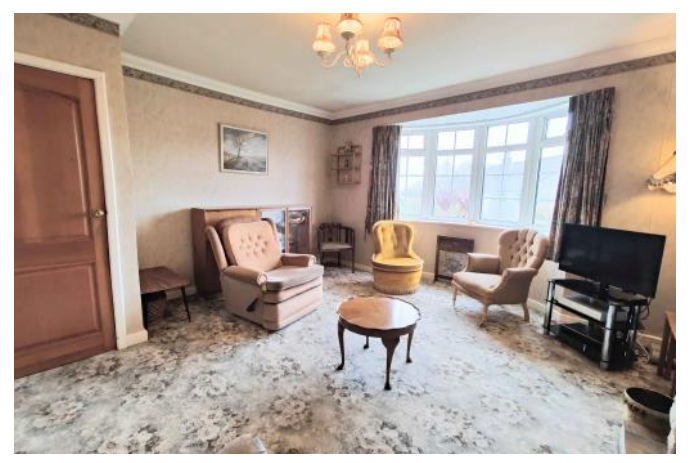
A spacious living room that offers plenty of space