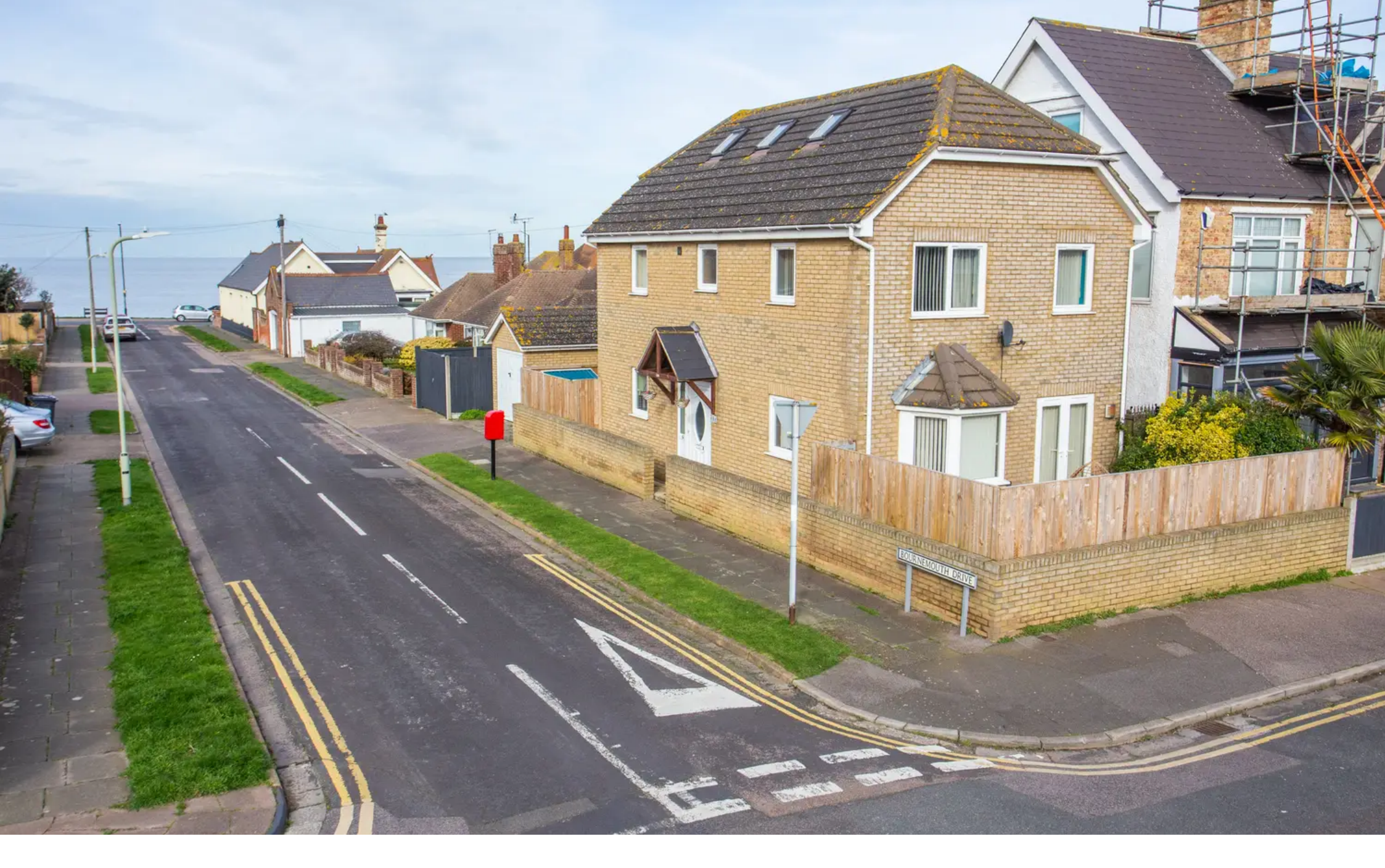
68a Bournemouth Drive, Herne Bay £475,000