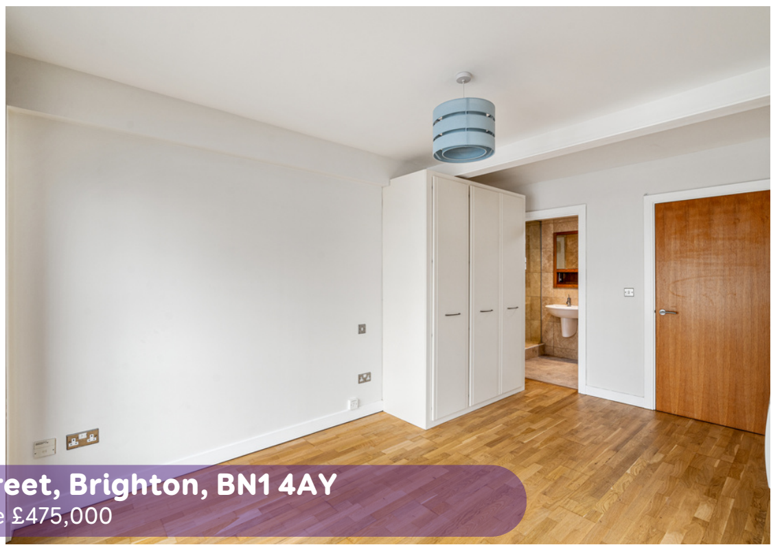
Argus Lofts, Robert Street, Brighton, BN1 4AY Asking Price £475,000