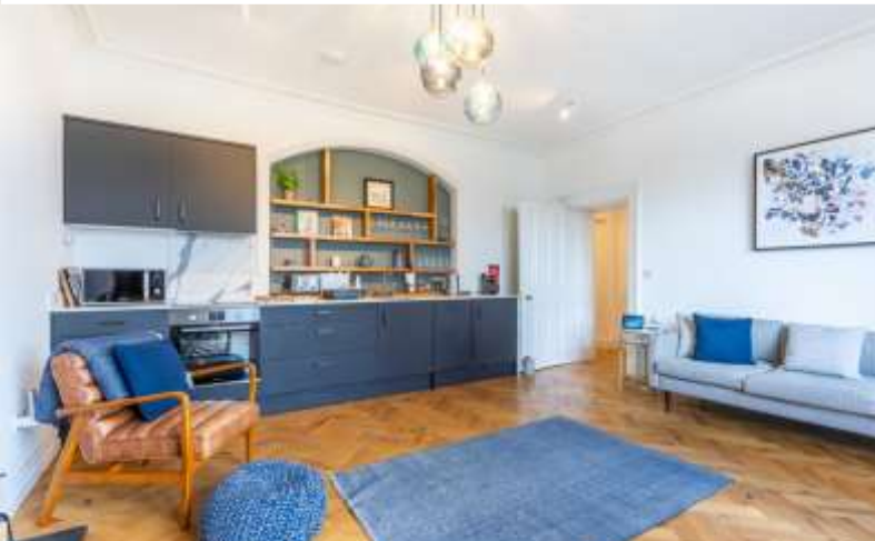
Open plan living room/kitchen