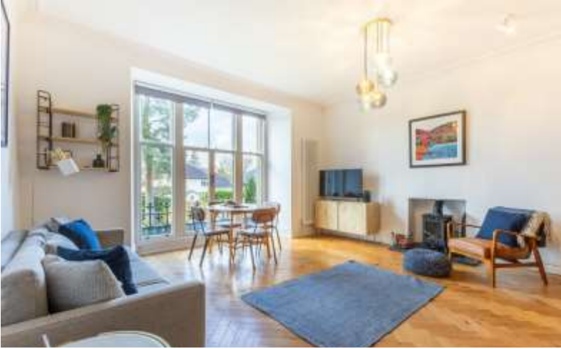
Open plan living room/kitchen