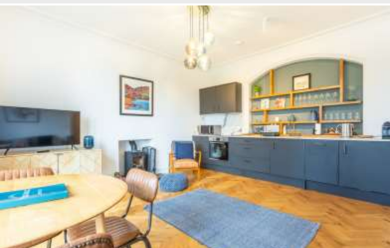
Open plan living room/kitchen