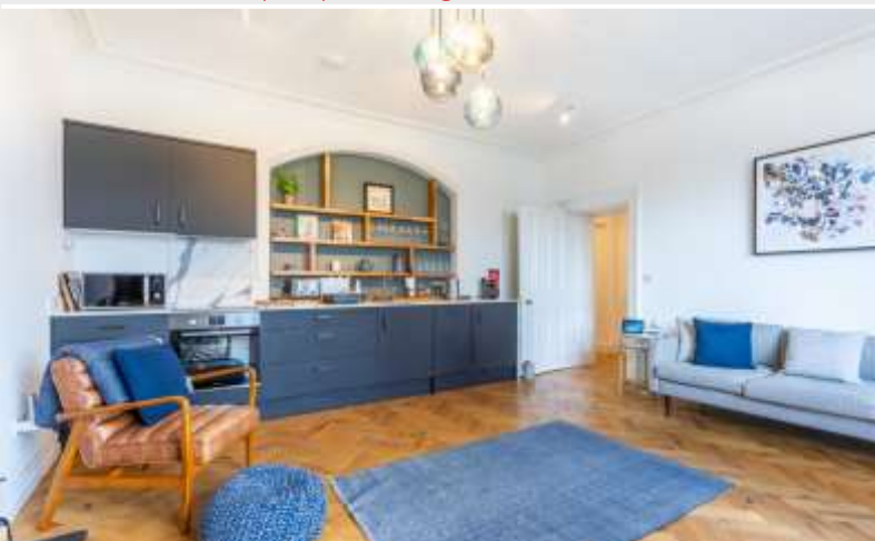
Open plan living room/kitchen