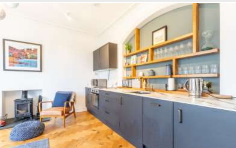
Open plan living room/kitchen

Description: An immaculately presented and spacious 2 bedroomed ground floor apartment in a fantastic location being only a few minutes level walk into Windermere yet tucked away in a quiet location. The property benefits from a designated off road parking space and well maintained communal gardens. This property is an ideal weekend retreat, holiday let or indeed a low maintenance home.