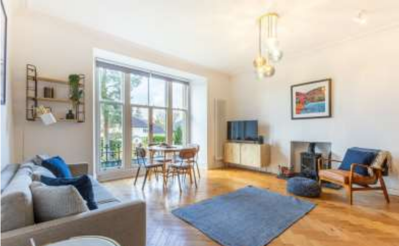
Open plan living room/kitchen