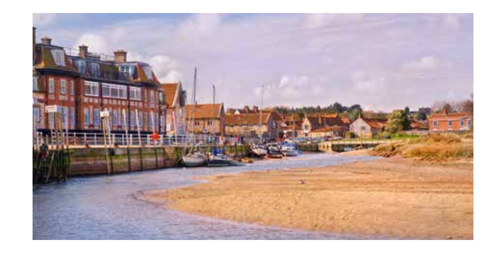
Nearby Blakeney offers gorgeous views and a great place to explore.

"With the heritage coastline so near by, you can enjoy the best elements of a Norfolk lifestyle."