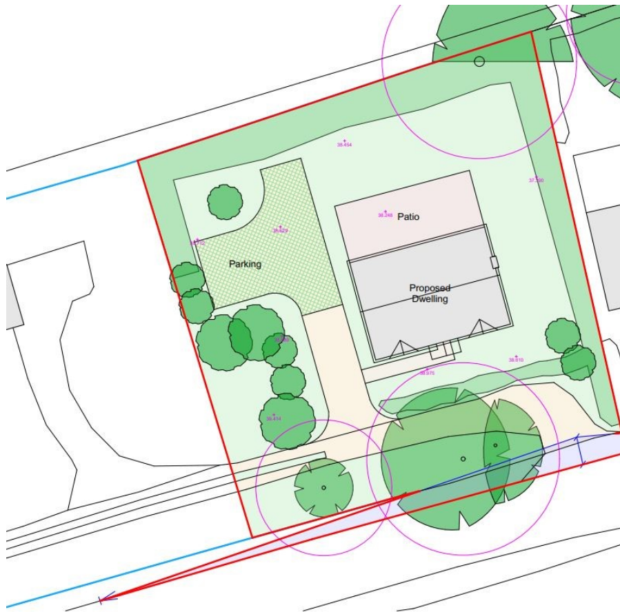
PROPOSED SITE LAYOUT (Planning Illustration) Not to scale