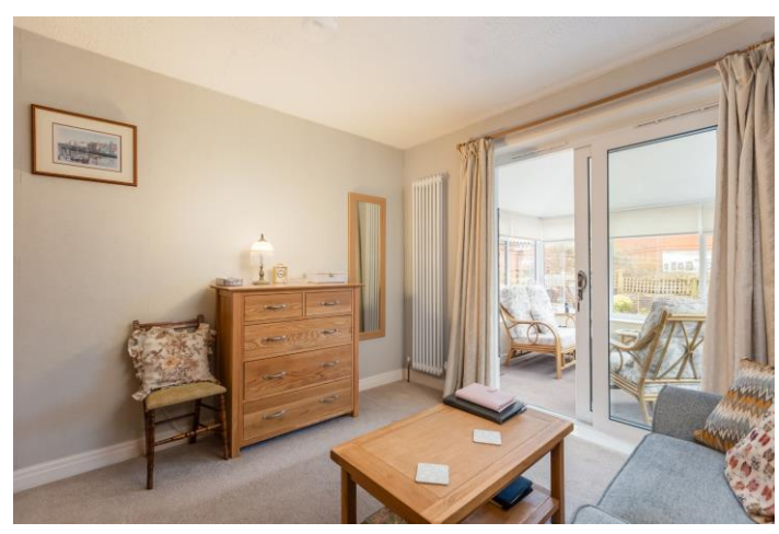
BEDROOM THREE/STUDY 2.66 m (8'9") x 2.00 m (6'7")

Casement window to the side. Radiator set within a radiator cover.