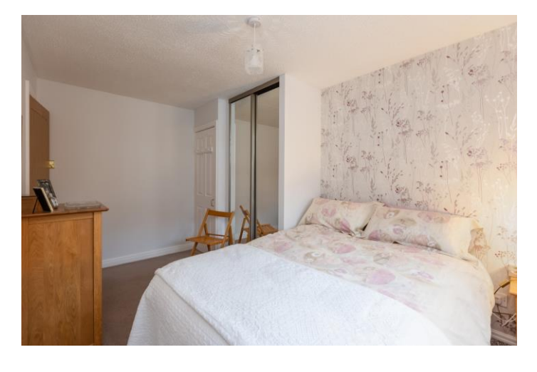
BEDROOM TWO 3.30 m (10'10") x 3.22 m (10'7")

Vertical radiator. Sliding patio doors leading into the Garden Room.