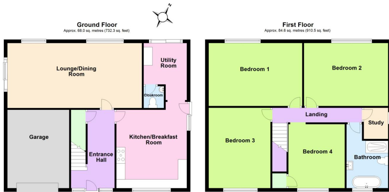
Total area: approx. 152.6 sq. metres (1642.7 sq. feet)