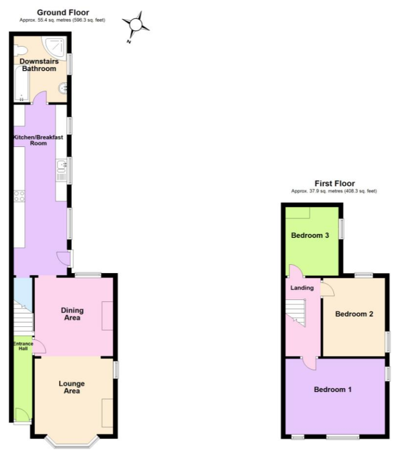
Total area: approx. 93.3 sq. metres (1004.6 sq. feet)