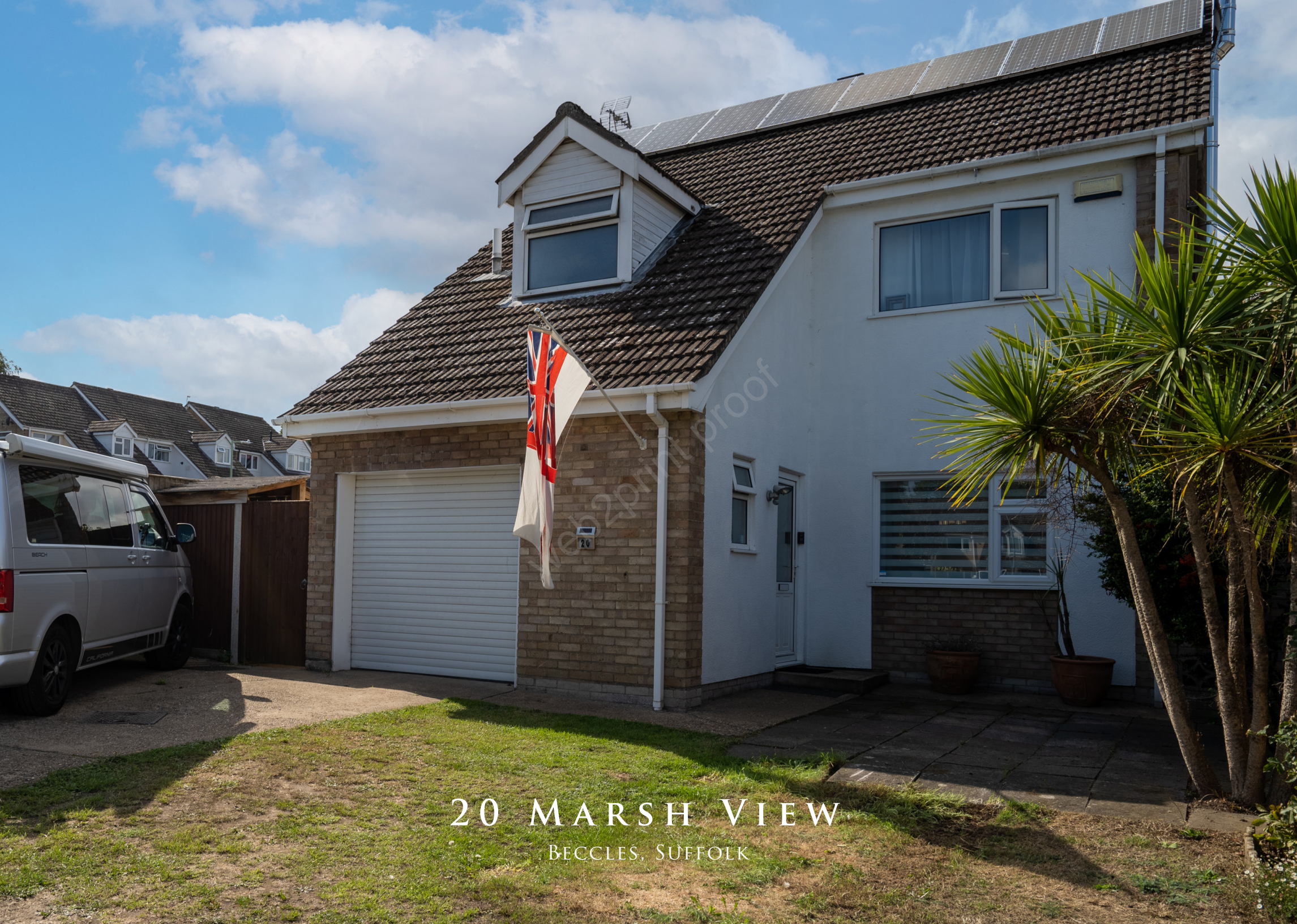
20 MARSH VIEW BECCLES, SUFFOLK