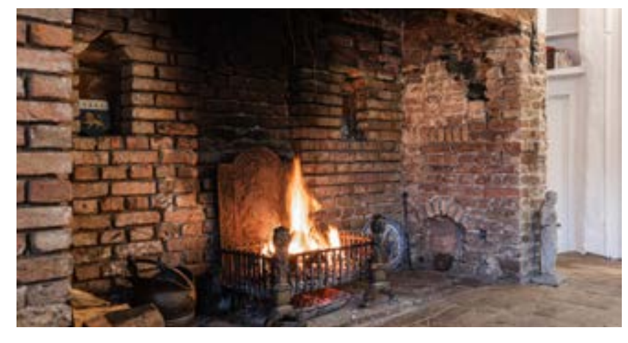
Sitting room inglenook fireplace.

"We love to sit infront of the lit, inglenook fire with a glass of wine, especially at Christmas."