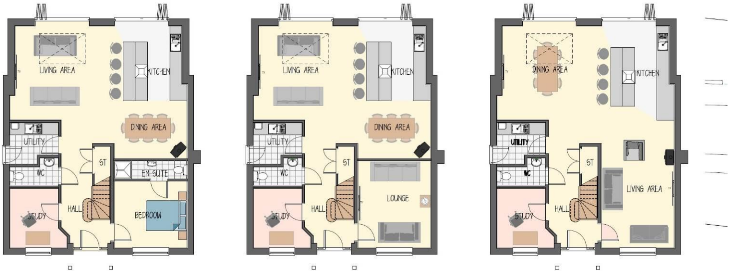
OPTION 1 GROUND FLOOR PLAN

The property information provided by John German Estate Agents Ltd is based on enquiries made of the vendor and from information available in the public domain. If there is any point on which you require further clarification, please contact the office and we will be pleased to check the information for you, particularly if contemplating travelling some distance to view the property. Please note if your enquiry is of a legal or structural nature, we advise you to seek advice from a qualified professional in their relevant field.