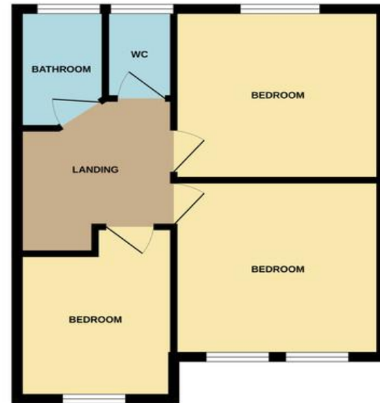
1ST FLOOR 425 sq.ft. (39.5 sq.m.) approx.