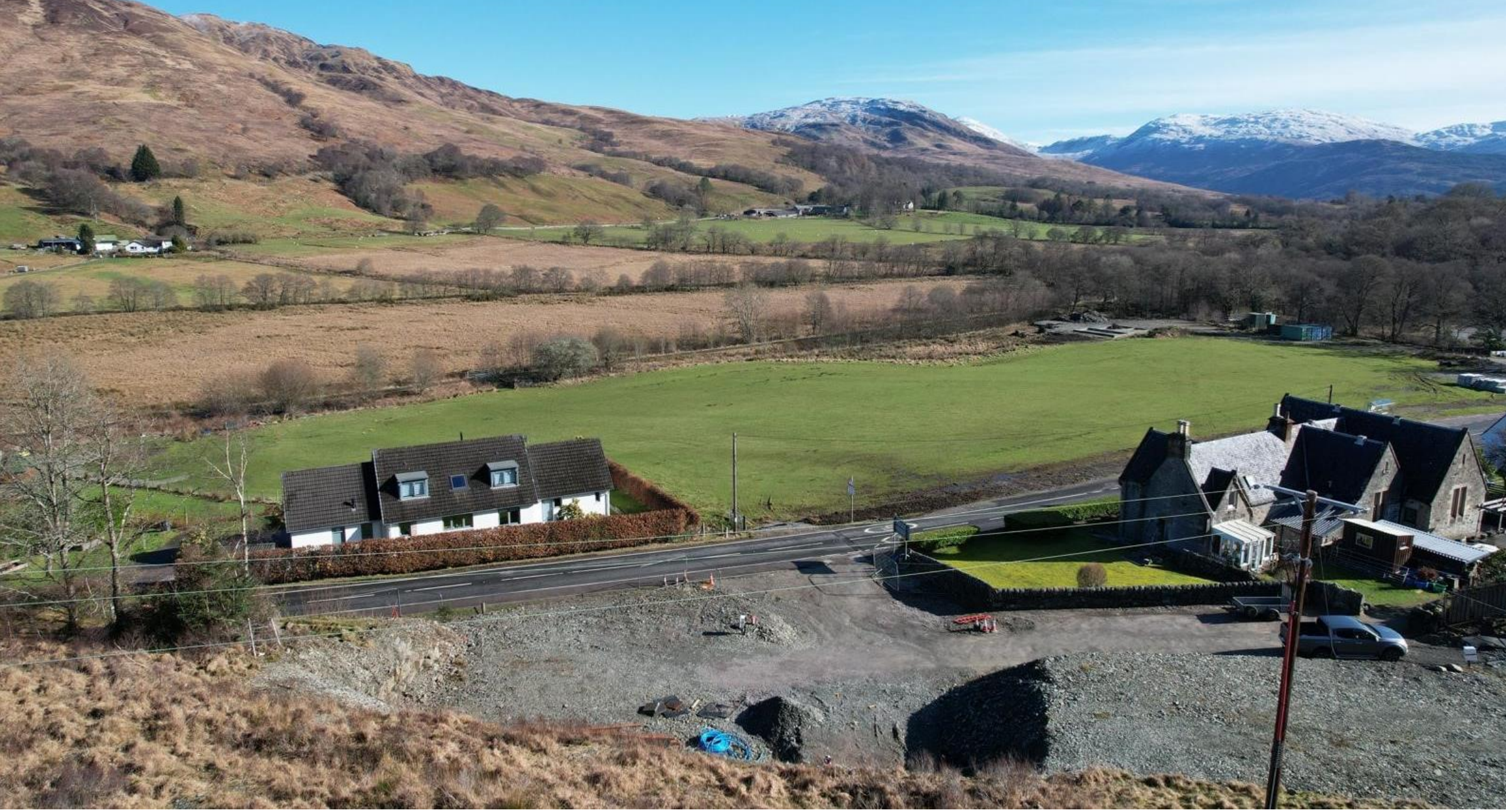
Plot 1, Tynribbie Hill