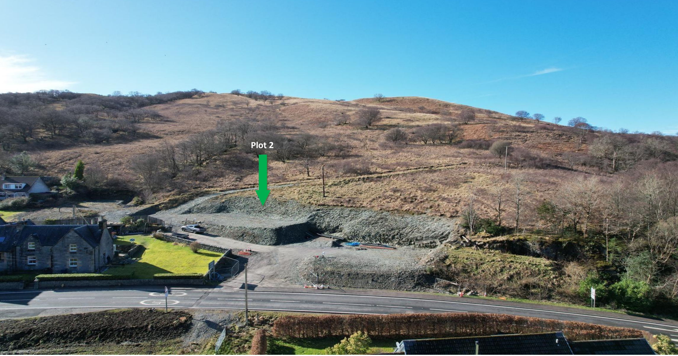
Plot 2, Tynribbie Hill