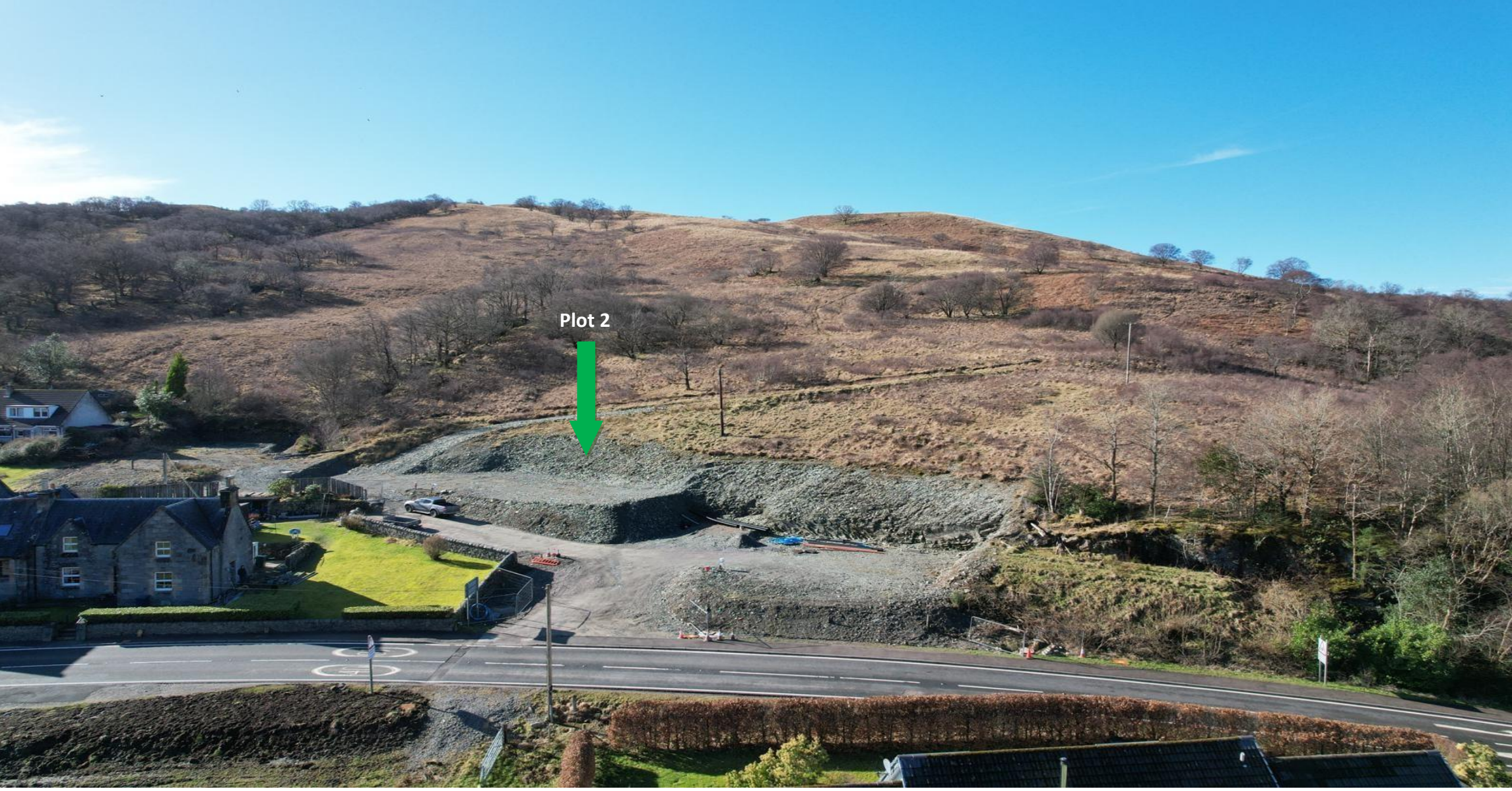
Plot 2, Tynribbie Hill