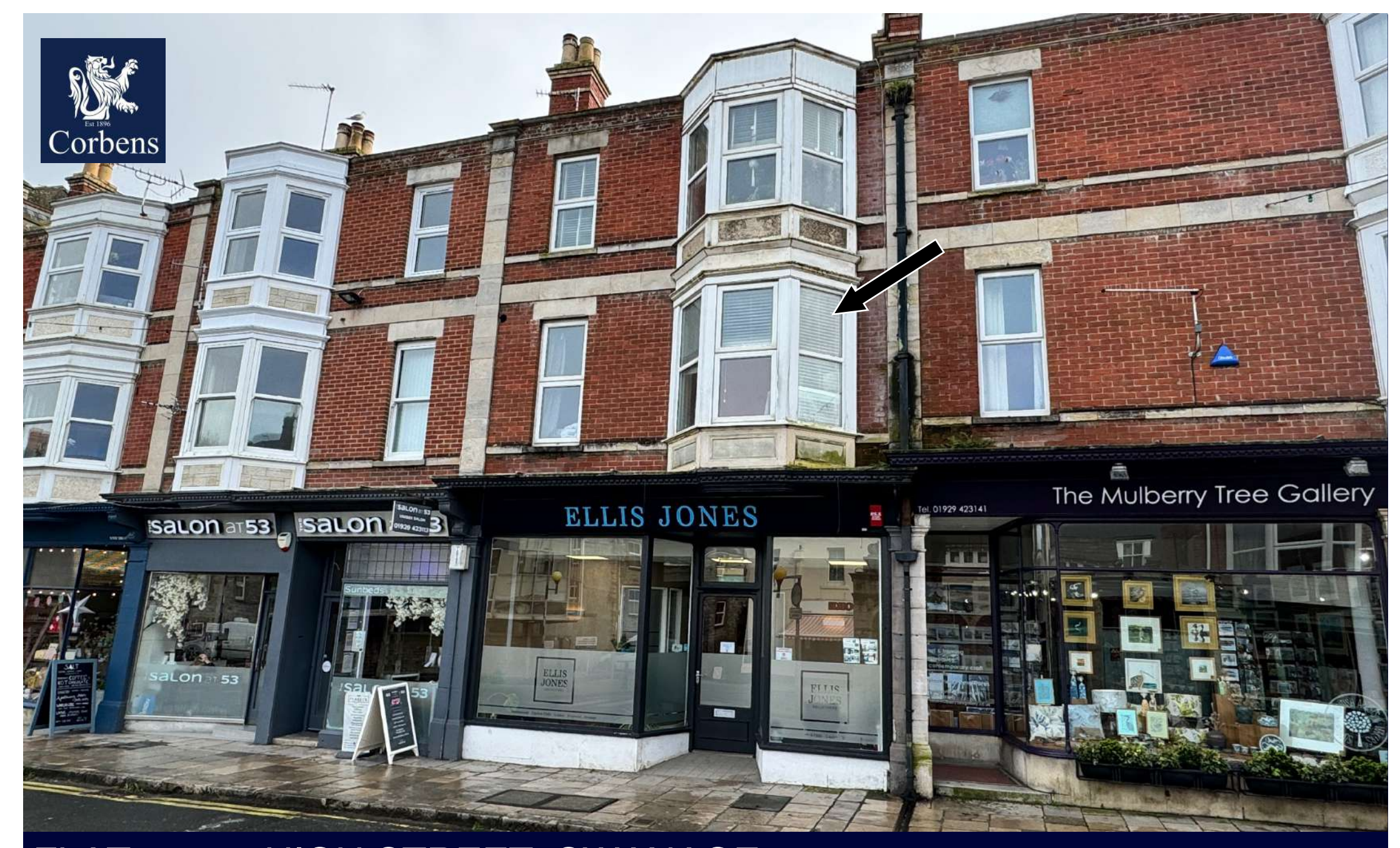
FLAT 1, 55a HIGH STREET, SWANAGE £169,950 Leasehold