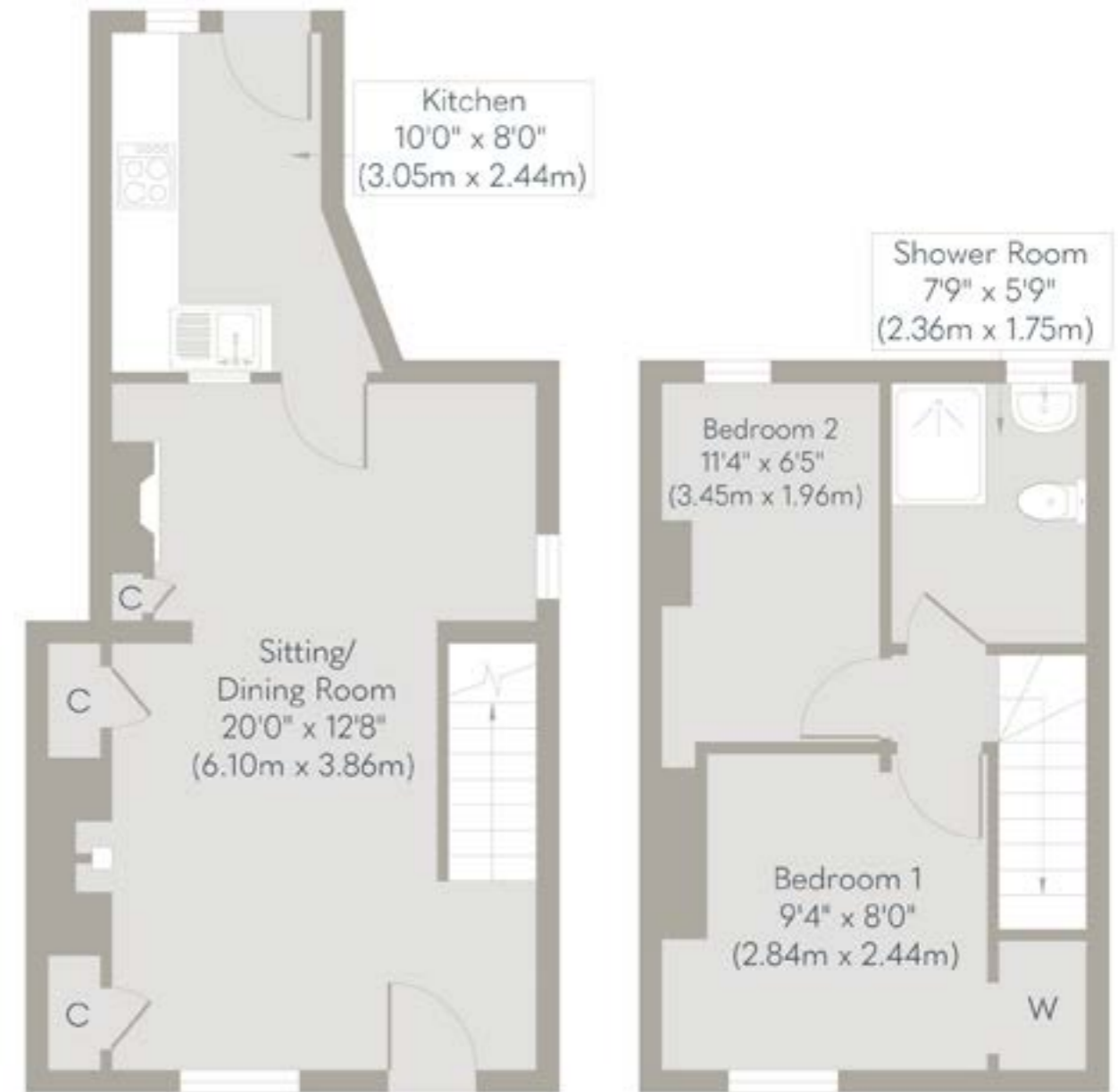
Ground Floor Approximate Floor Area 345 sq. ft (32.05 sq. m)