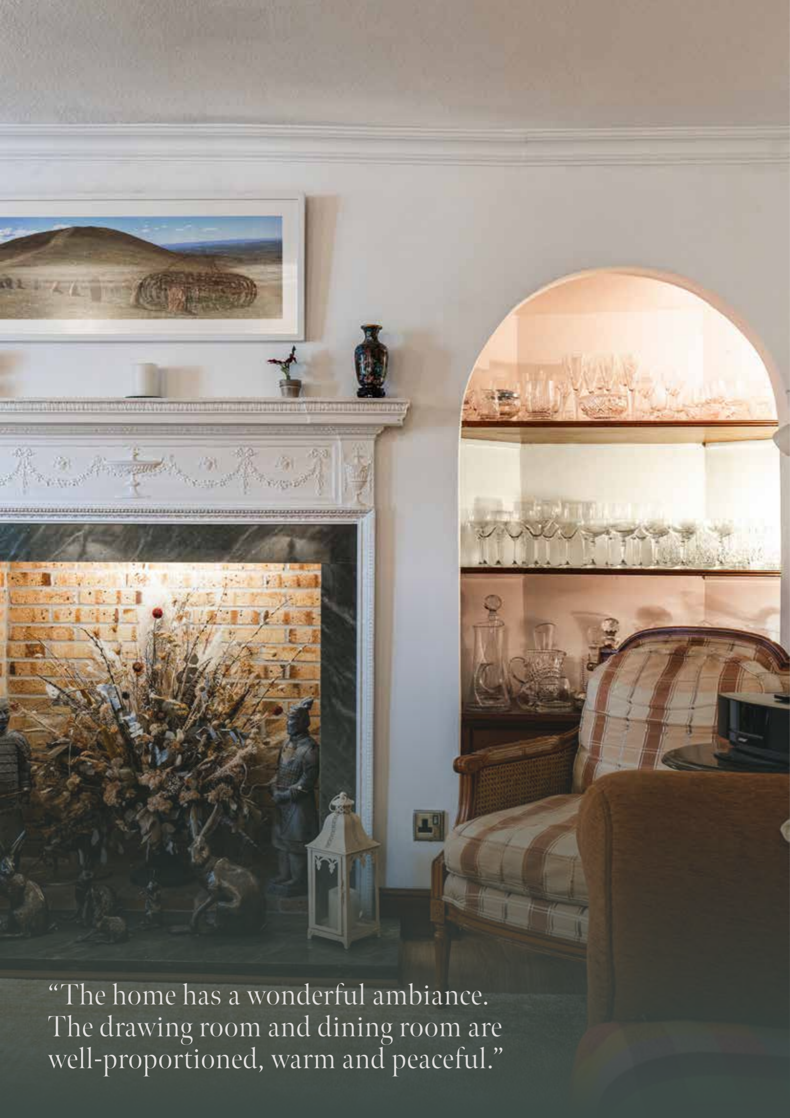
“The home has a wonderful ambiance. The drawing room and dining room are well-proportioned, warm and peaceful.”