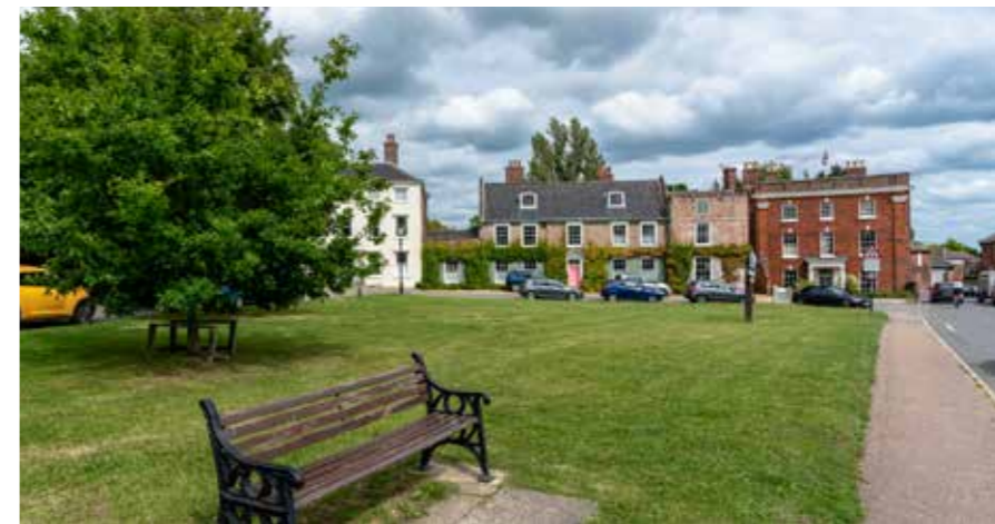
Hingham village green

“The sense of community has strengthened - excellent neighbours, supper and wine clubs, superb local facilities and an award-winning local surgery.”