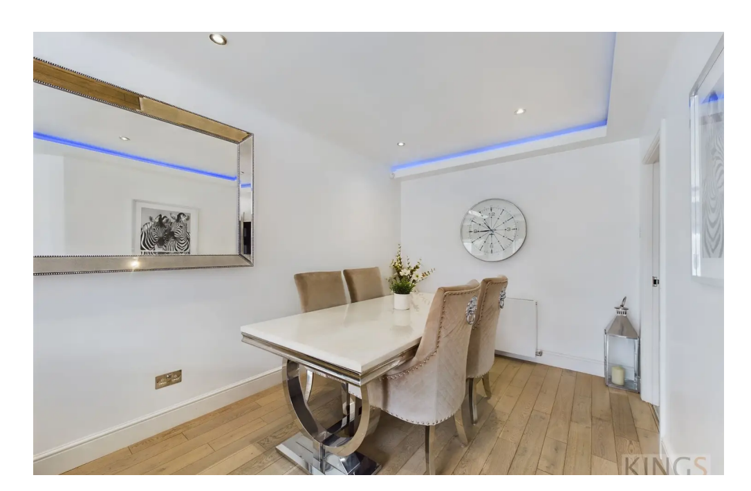
Council Tax band: D Tenure: Freehold EPC Energy Efficiency Rating: D EPC Environmental Impact Rating: