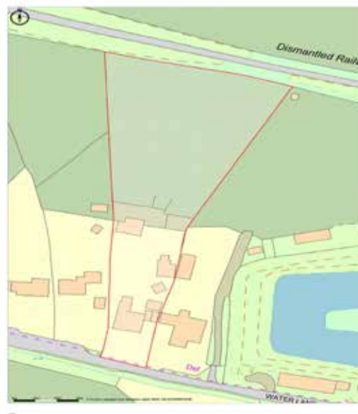
omap © Crises Copyright and database rights 2004 CO ACCRESSIONAL