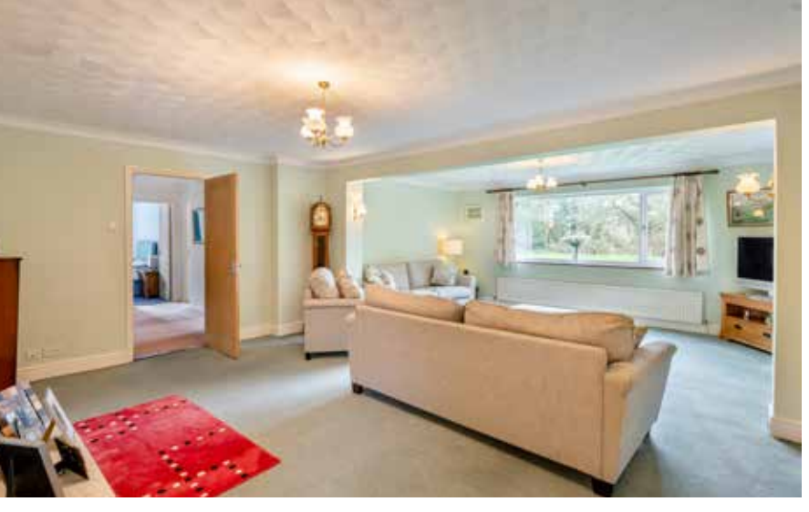
A Light And Bright Space