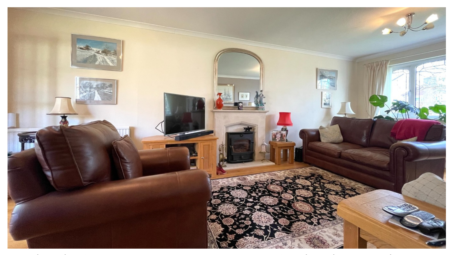
This spacious four double bedroom detached property can be found in a quiet cul-de-sac in the rural West Northamptonshire village of Lower Boddington