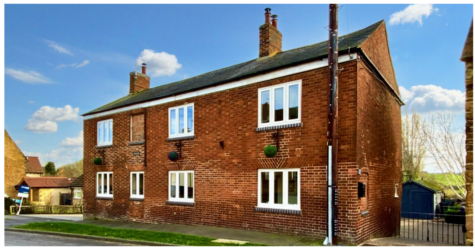
4 Bedrooms | 1 Bathroom | 3 Reception Rooms | Renovated