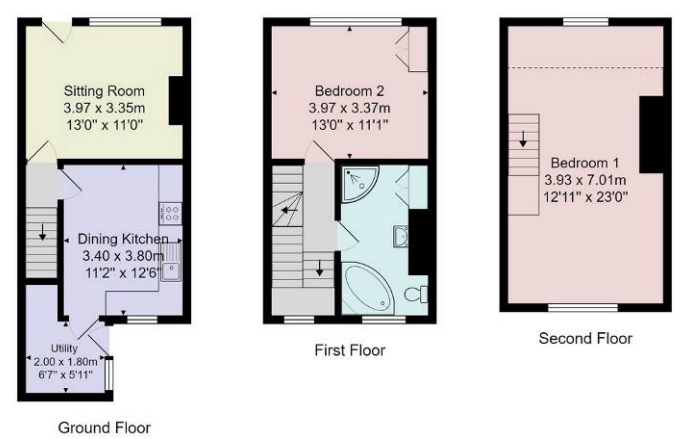
Total Area: 89.5 m²... 963 ft² All measurements are approximate and for display purposes only. No liability is accepted by either the agency or Box Property Solutions Ltd as to the exact measurements of the rooms. Box Property Solutions Ltd retains the copyright on this plan and allows agents to use it with agreed permission. Copyright 2022 Ac2