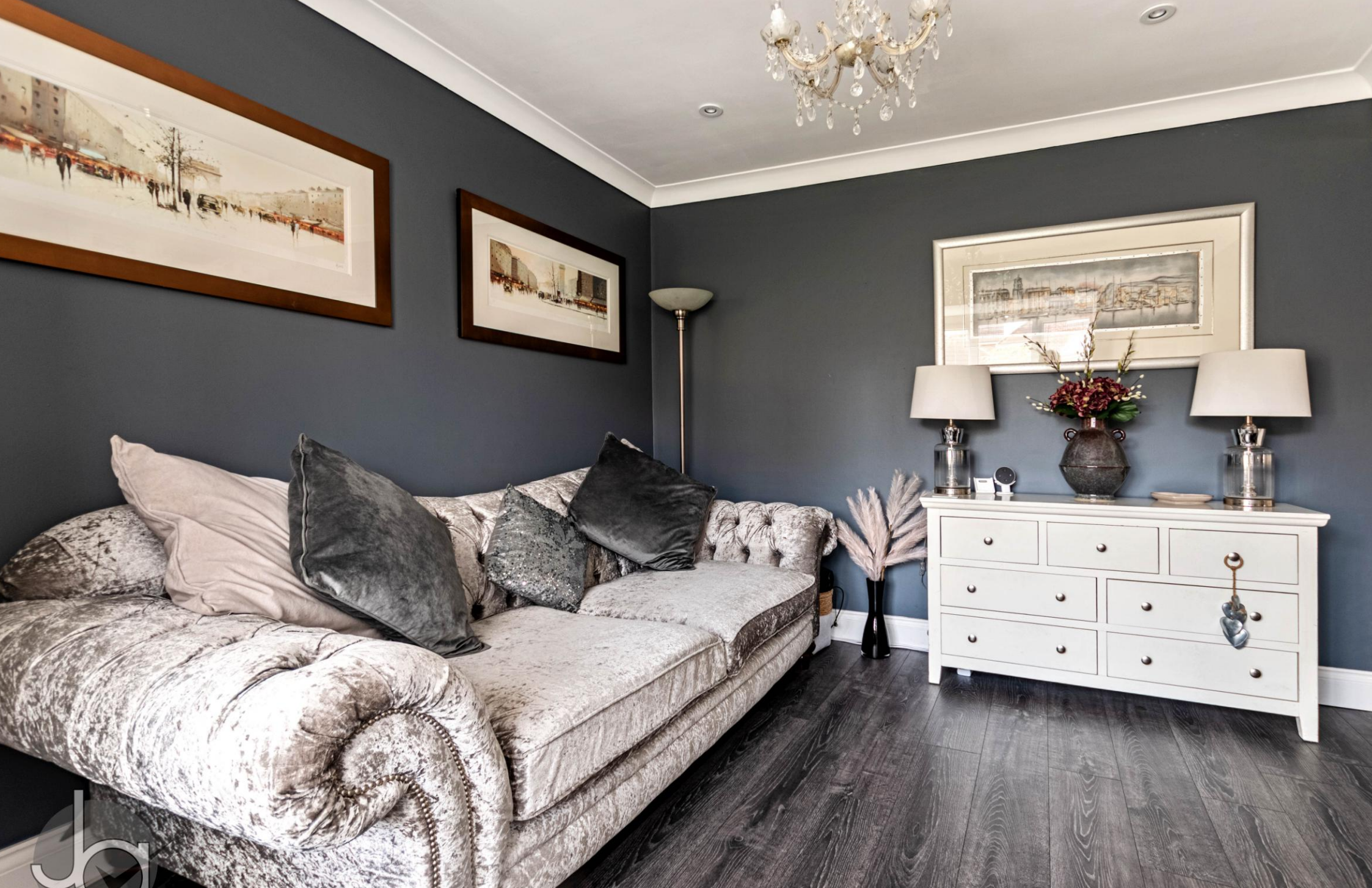
Sandmartin Crescent, Stanway, Colchester, CO3 8WQ