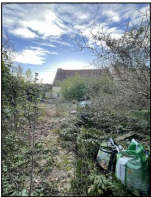
For Sale – 45 Horsegate, Deeping St James, Lincolnshire, PE6 8EW