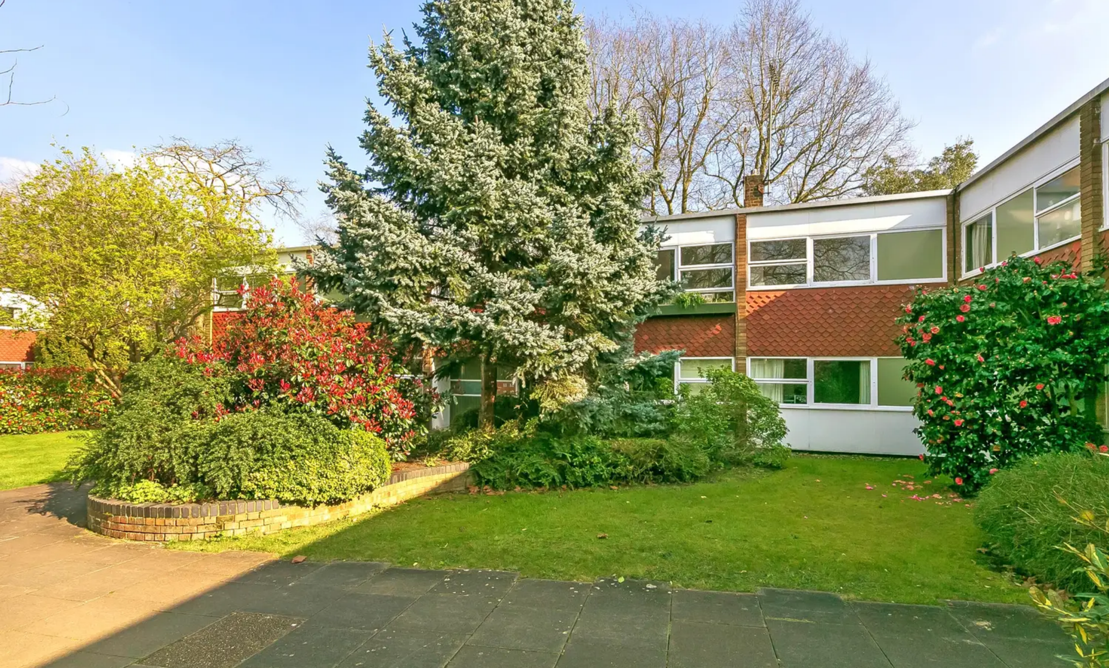
12 Dryden Court Parkleys, Richmond £399,950