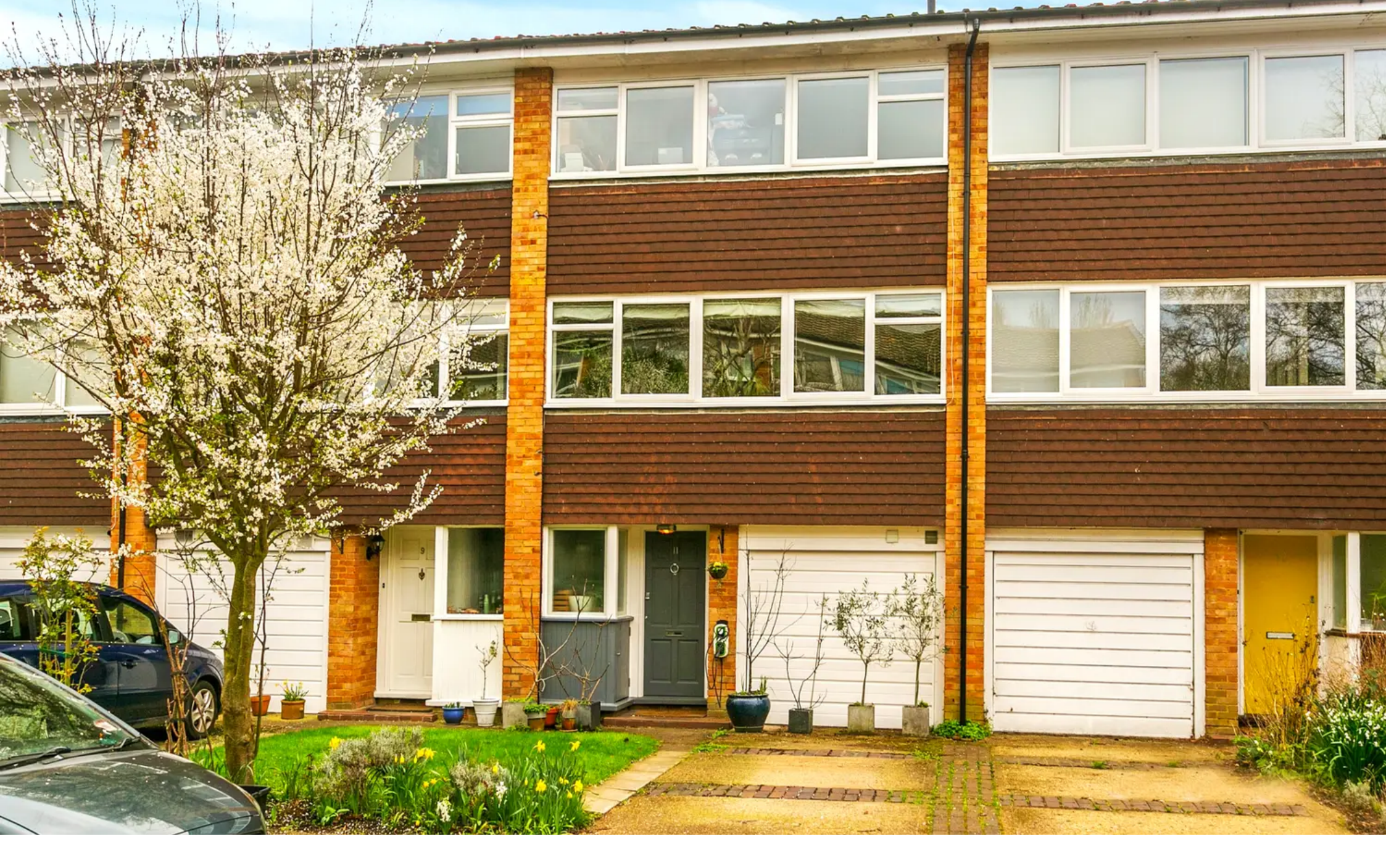
11 Lake Gardens, Richmond £775,000