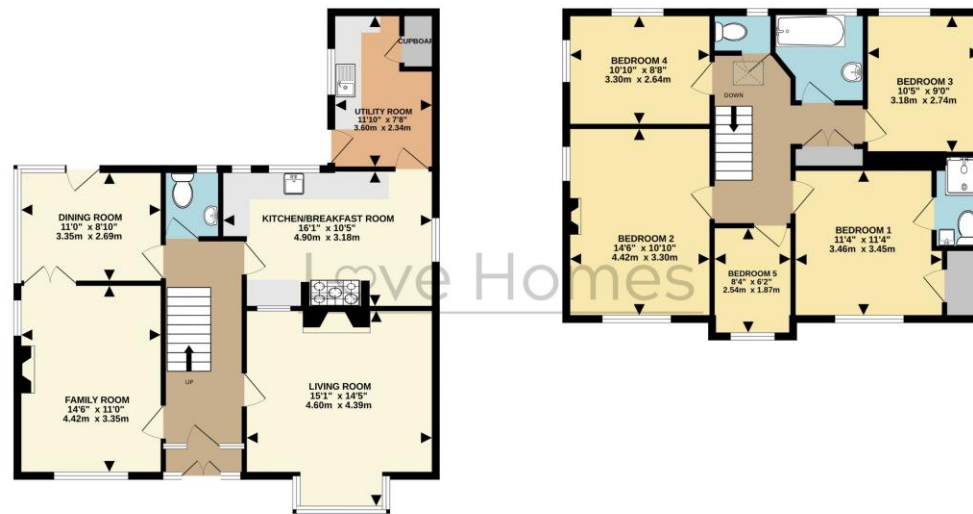
Drawn by Love Homes for illustrative purposes only. Measurements and areas shown are approximate. Made with Metropix ©2024